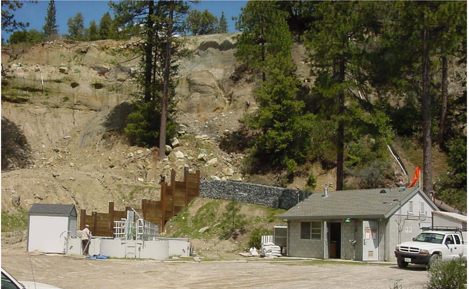
Cascade Shores Plant Site on April 13, 2006